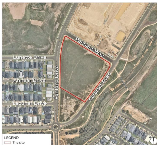
Figure 1 Site Aerial